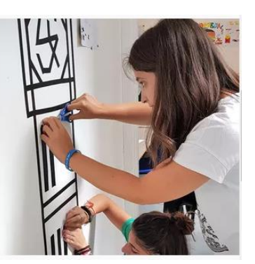
SKOLA Camden, Annex – Summer 10-16