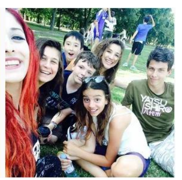
SKOLA Primrose Hill - Summer 6-9