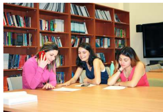
Modern classrooms • Interactive whiteboards • Computer labs • Library