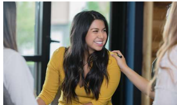
On-site Barista • Rooftop garden & BBQ • Student counsellor • Prayer room