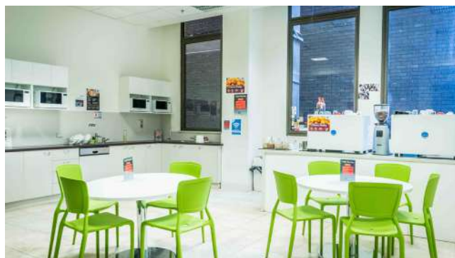
Student lounge • Student cafe • Student kitchenette