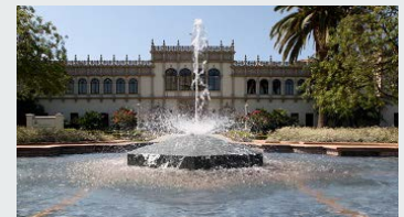
English Language Academy, University of San Diego

Studying abroad can be one of the most exciting experiences of your life! The English Language Academy (ELA) offers a total immersion experience, where you can improve your English and also enjoy San Diego – a beautiful city in Southern California.