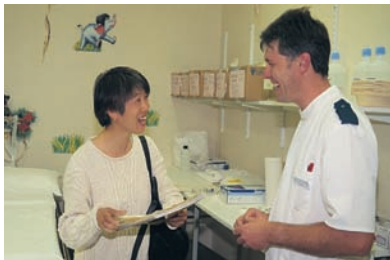
Medical student meeting a hospital colleague

We organise meetings, visits or placements in organisations working in the same professional field as you. We can put you in contact with local companies for possible business links. You should apply for such visits when booking your course.