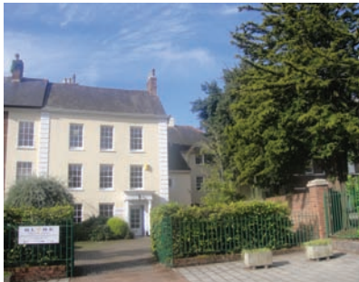
The Globe Reception