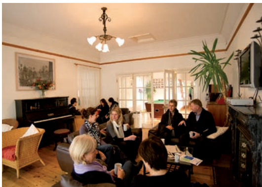
A Student Lounge

The school has 2 south facing terraces and a large garden with views over the valley where students can